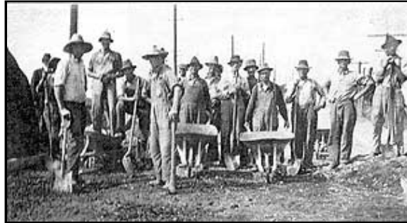
The Wheel Barrow crew.

Highway 33A from St. Marys to Wapakoneta being paved with concrete. The road has been improved over the years from mud, to plank, to gravel, to brick in 1918. These photos are estimated to have been taken in 1927.