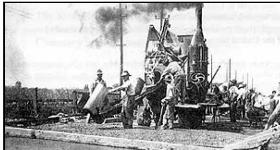
The concrete was mixed and poured on the job site.