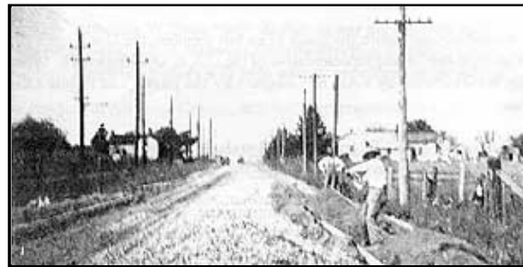
Preparing the surface.

Many men were employed to do this hard work.