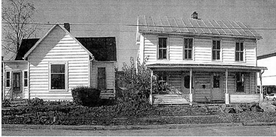
Photo of homes located on North Chestnut Street in St. Marys on October 11, 2003. The three bedroom at 119 Chestnut Street and 125-127 a duplex were razed for the new Telephone Service Company office.