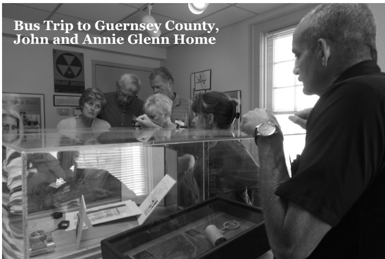
Bus Trip to Guernsey County, John and Annie Glenn Home