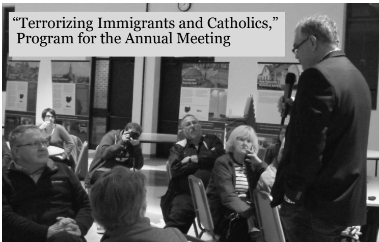
"Terrorizing Immigrants and Catholics," Program for the Annual Meeting

Who can guess what this Cridersville artifact is?