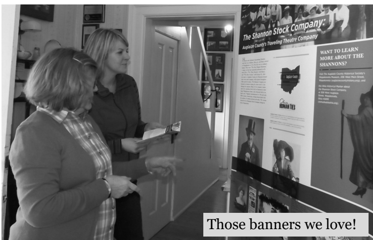
Those banners we love!