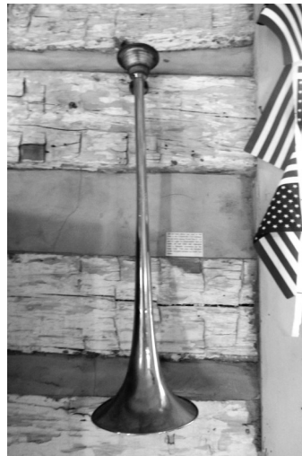
Scenes from 2017

The image to the left is from our fair exhibit, "Life on the Home Front."